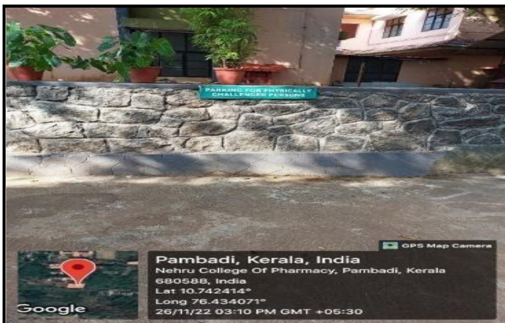
DISABLED FRIENDLY PARKING SPACE